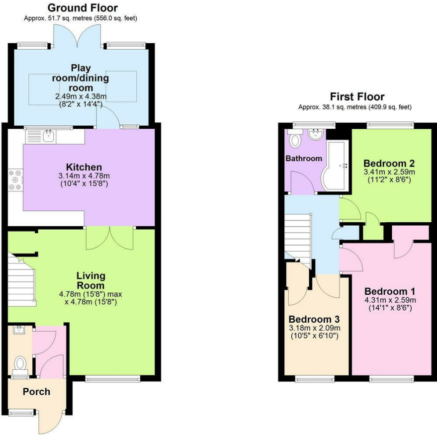
Total area: approx. 89.7 sq. metres (966.0 sq. feet) Blenheim Road